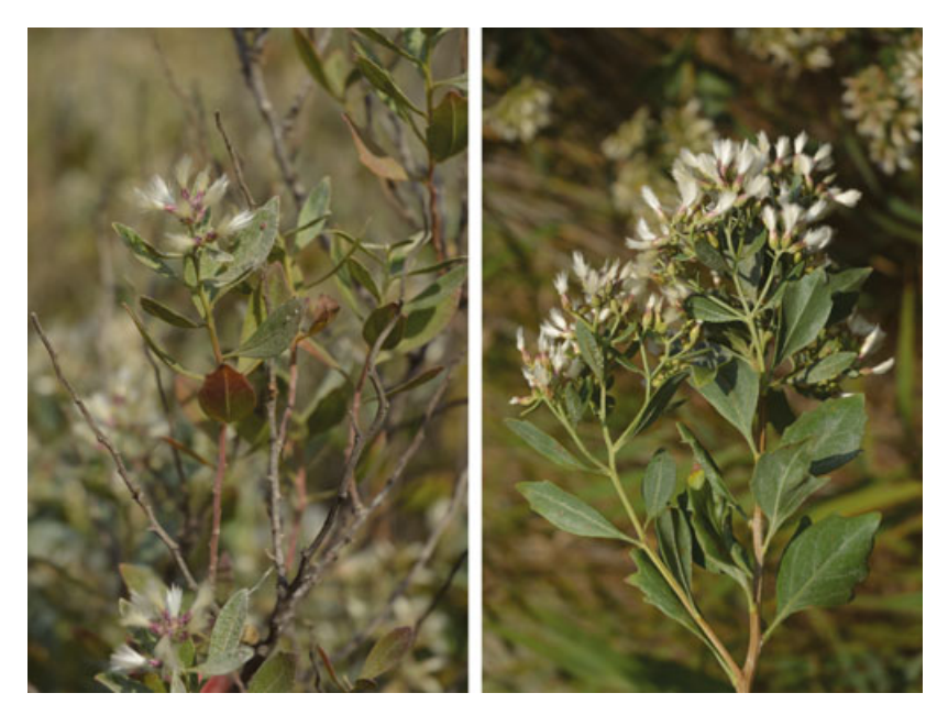
Fig. 4 Comparison of the reproductive output of attacked (left) and healthy (right) individuals of Baccharis halimifolia . Attacked individuals showed fewer flowerheads per inflorescence and senescent leaves appeared more rapidly.

widespread on B. halimifolia , although never very abundant and without significant damage observed (P. Dauphin, pers. comm., 2013). In addition, an unidentified wax scale insect species has been reported in Spain, in the Basque range of B. halimifolia (Caño et al. , unpublished data).