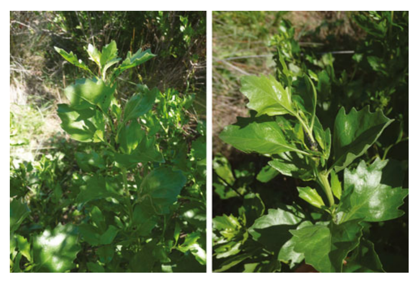
Fig. 2 Aphis fabae on young shoots of Baccharis halimifolia.